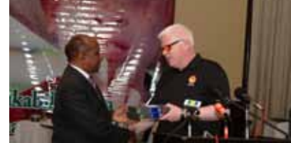
Reginald Mengi Receiving Master Copies of Documentary

Media mogul, business man and human rights activist Reginald Mengi invited us to his home where he committed to release the documentary in both the English and Kiswahili versions during prime time on all his television stations.