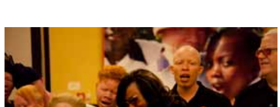
Famous Tanzanian Musician Sings to PWA at Gala

The Gala was very well received by all 180 guests including Politicians, National Artist, Athletes, Business People & many PWA'. The guests were invited because of their influence on Tanzanian Politics, Business and Culture. We appealed to their "currency of influence" and asked them to invest it generously in support of their fellow citizens with albinism.